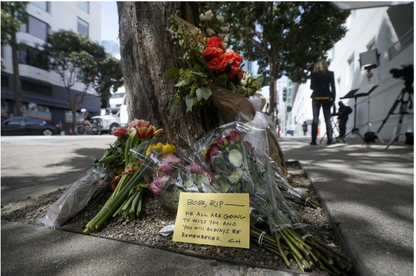
Flowers were left at the scene of the stabbing death of technology executive Bob Lee.

"He was a dedicated father. He was more mature than that," she said. At the most, she said she suspected he was microdosing ketamine as a treatment for depression.