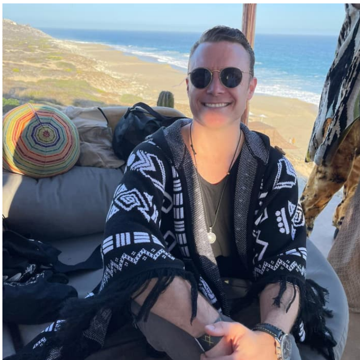
Bob Lee in San José del Cabo, Mexico.